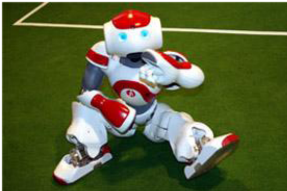
(a) real robot

The Nao humanoid robot manufactured by Aldebaran Robotics. This is the robot currently used in the competitions of the 3D Soccer Simulation League at RoboCup. Its height is about 57cm and its weight is around 4.5kg . Its biped architecture with 22 degrees of freedom allows Nao to have great mobility. The rcssserver3D can simulate the Nao robot nicely, see Figure 8.5.