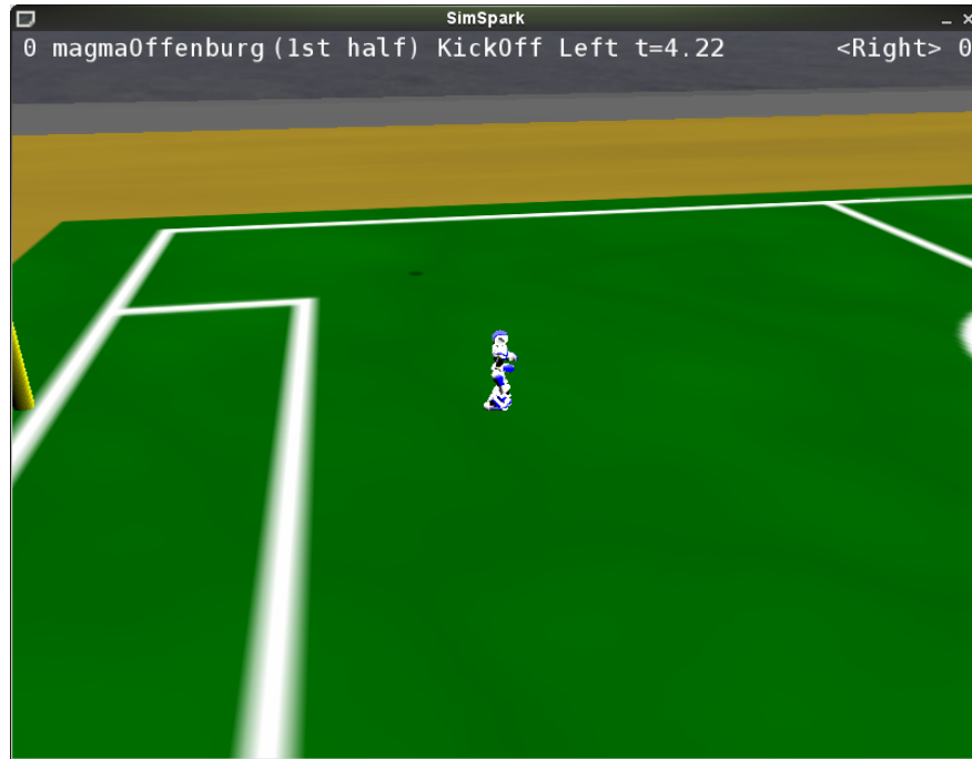
Figure 3.5: Press 'k' to start the game. The play mode will switch to 'KickOff Left' and the time will advance.

The next step is to start the soccer game. To do this please change back to the monitor window and press 'k'. The simulation time now start running and the game state changes to BeforeKickOff, please compare to figure 3.5.